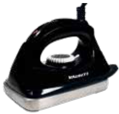
119-V1400 WAX IRON ECONOMY. 1000W