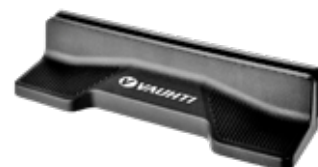
100-630 PLEXI SHARP (WAX SCRAPER SHARPENER)