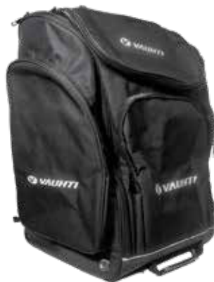
130-01533 VAUHTI BACKPACK LARGE