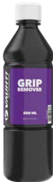
930-GR500 GRIP REMOVER 500ml