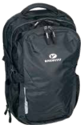
130-01527 VAUHTI BACKPACK