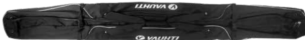
130-01539 VAUHTI ALPINE SKI BAG 1 PAIR