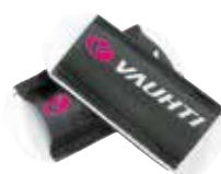
130-01511 SKI HOLDER