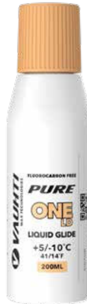
32140-ONELD200 PURE ONE LD +5/-10°C | 41/14°F For wide temperature range and for variable conditions.