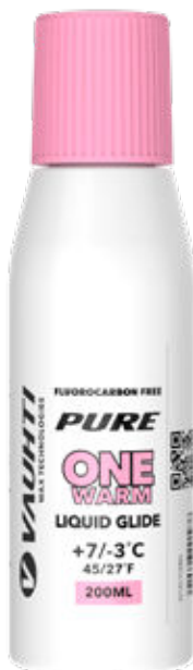
32140-ONEW200 PURE ONE WARM +7/-3°C | 45/27°F For wet and damp snow down to -3°C degrees. conditions.