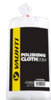
110-00960 20 M 110-00980 10 M POLISHING CLOTH