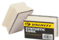
105-00911 SYNTHETIC CORK WITH SANDPAPER