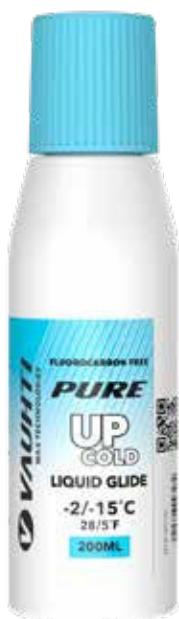
32130-UPC200 PURE UP COLD -2/-15°C | 28/5°F For cold snow conditions.