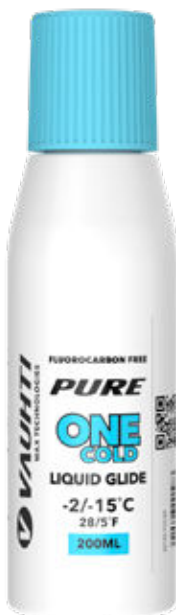
32140-ONEC200 PURE ONE COLD -2/-15°C | 28/5°F For cold snow conditions.