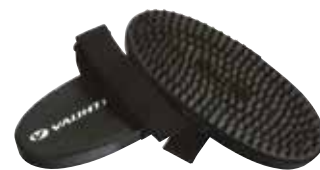
2000-ABM ALPINE METAL BRUSH OVAL