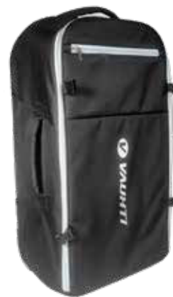
130-01531 VAUHTI TRAVEL BAG