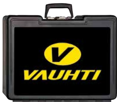
130-01370 WAX BOX LARGE