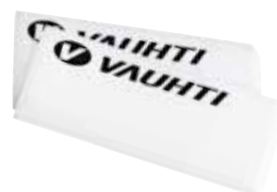
100-00830 ACRYL DESIGNED 5MM