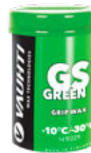
357-GSG GS GREEN -10/-30°C | 14/-22°F