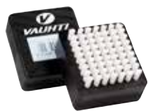
115-01010 NYLON BRUSH SMALL