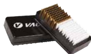
115-01035 NYLON/BRASS BRUSH