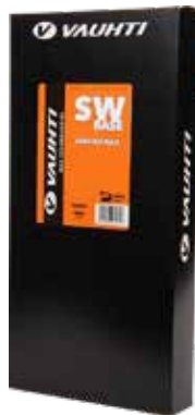
324-SWB900 SW BASE