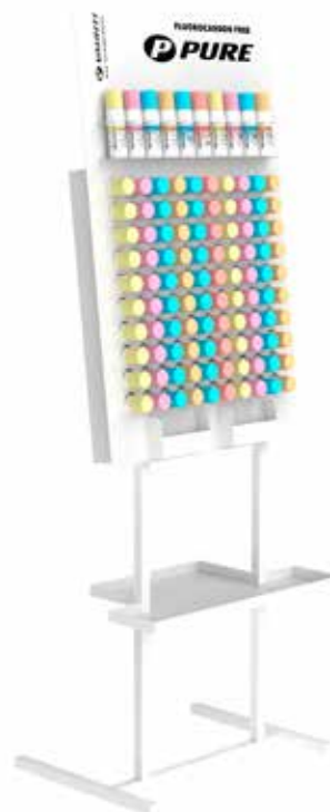
400-1008 BIG METAL DISPLAY, 2M LONG