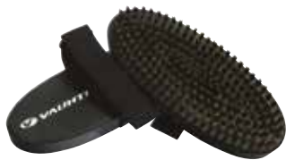
2000-ABHH ALPINE HORSE HAIR BRUSH OVAL