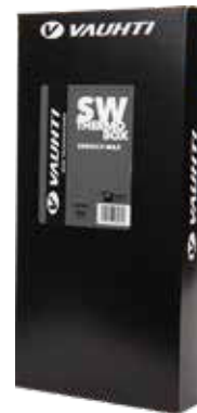
324-SWT900 SW THERMOBOX