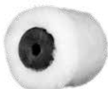
115-01078 ROTO MERINO WOOL BRUSH