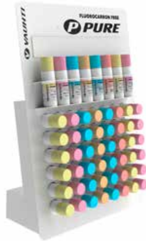
400-1006W SALES DISPLAY WHITE FOR 42 BOTTLES