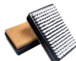
115-01015 NYLON BRUSH WITH NATURAL CORK