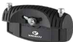
2000-3004 SHARP SIDEWALL PLANNER