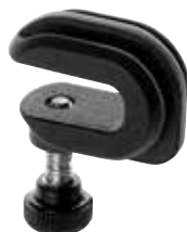
2000-3090 PRO CLAMP