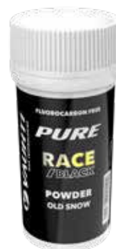
31110-RACEOSB35 PURE RACE OLD SNOW BLACK POWDER