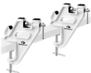
2000-690 SKI VISE QUICK