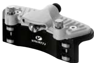
2000-5005N PRO SHARP