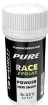
31110-RACENSP35 PURE RACE NEW SNOW POLAR -5/-25°C | 23/-13°F