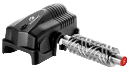
130-8001 NORDIC SHARP STRUCTURING TOOL WITH A W-FINE ROLLER