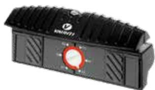
2000-5002 ERGO SHARP