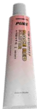
385-KPRR RACE RED +10/+1°C | 50/34°F