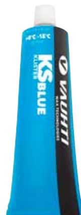
375-KSB KS BLUE 0/-15°C | 32/5°F