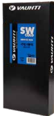
324-SWC900 SW COLD -1/-10°C | 30/14°F