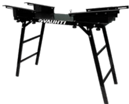
400-RWT WAX TABLE WITH TWO PROFILES