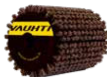
115-01072 ROTO HORSE HAIR BRUSH