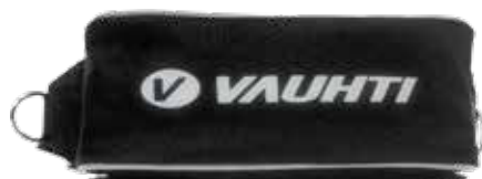
130-01535 VAUHTI SKI HARNESS