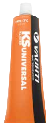
375-KSU KS UNIVERSAL +4/-7°C | 39/19°F