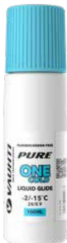
32140-ONEC100 PURE ONE COLD -2/-15°C | 28/5°F For cold snow conditions.