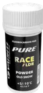
31110-RACEOSLDR35 PURE RACE OLD SNOW LDR +5/-10°C | 41/14°F