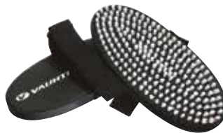
2000-ABN ALPINE NYLON BRUSH OVAL