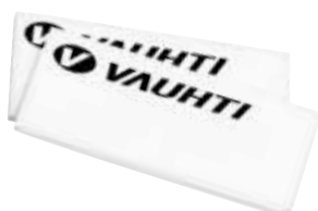
100-00810 ACRYL SCRAPER 3MM