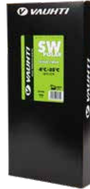
324-SWP900 SW POLAR -8/-25°C | 18/-13°F