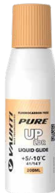
32130-UPLDR200 PURE UP LDR +5/-10°C | 41/14°F For wide temperature range and for variable conditions.