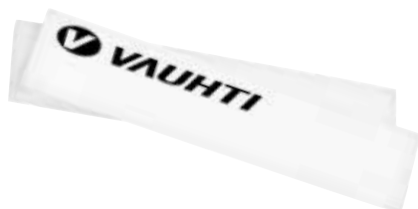
100-00840 SCRAPER SNOWBOARD