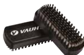
115-01060 STEEL BRUSH