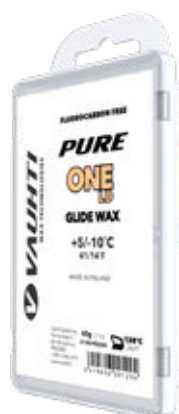
31140-ONELD60 31141-ONELD180 PURE ONE LD +5/-10°C | 41/14°F