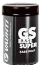
357-GSBAS GS BASE SUPER ALL TEMP