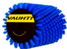
115-01070 ROTO NYLON BRUSH