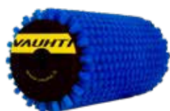
115-01077 ROTO NYLON BRUSH 140MM