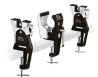
2000-1070 SKI VISE RACE