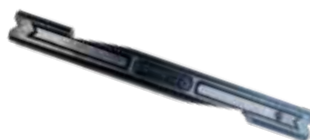
100-00870 GROOVE SCRAPER