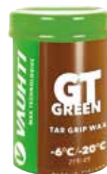
367-GTG GT GREEN -6/-20°C | 21/-4°F