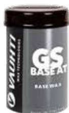
357-GSBA GS BASE AT ALL TEMP