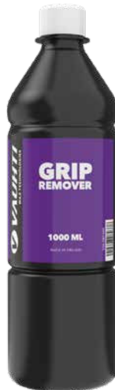
930-GR1000 GRIP REMOVER 1000ml