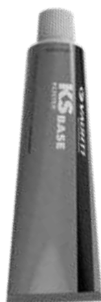
375-KSB KS BASE