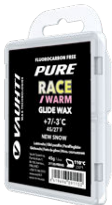
31110-RACENSW45 PURE RACE NEW SNOW WARM +7/-3°C | 45/27°F