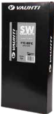
324-SWG900 SW GRAPHITE -1/-25°C | 30/-13°F