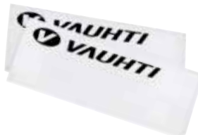
100-00820 ACRYL SCRAPER JUMBO 5MM