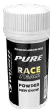
31110-RACENSB35 PURE RACE NEW SNOW BLACK