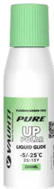
32130-UPP200 PURE UP POLAR -5/-25°C | 23/-13°F For cold and dry snow conditions.