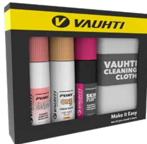
32410-PSGKIT PURE KIT: SKIN & GLIDE