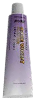
385-KPRV RACE VIOLET +2/-6°C | 36/21°F