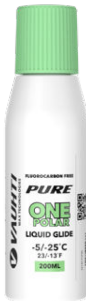
32140-ONEP200 PURE POLAR -5/-25°C | 23/-13°F For cold and dry snow conditions.