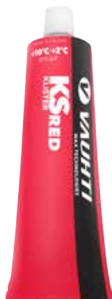
375-KSR KS RED +10/+2°C | 50/36°F