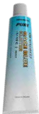
385-KPRB RACE BLUE -1/-15°C | 30/5°F