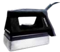
119-V1600 WAX IRON 35MM THICK AND DIGITAL. 1000W