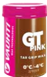
367-GTP GT PINK 0/-4°C | 32/25°F