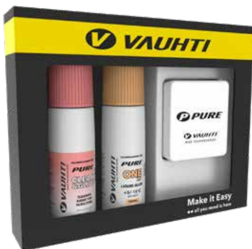
32410-PGKIT PURE KIT: GLIDE