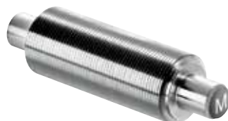
130-8003 LINEAR MEDIUM ROLLER UNIVERSAL