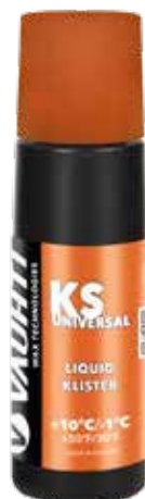
341-LKSU KS UNIVERSAL - liquid klister +10/-1°C | 50/30°F

All temp liquid base klister. Use as base for other grip waxes or klisters.