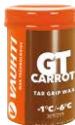
367-GTC GT CARROT -1/-6°C | 30/21°F