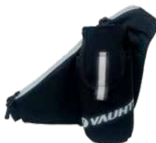
130-01525 VAUHTI DRINKBELT WITH BOTTLE