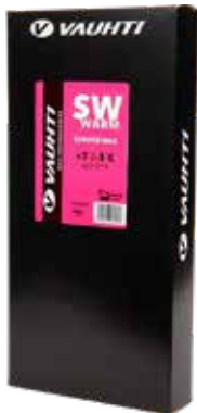
324-SWWA900 SW WARM +7/-3°C | 45/27°F