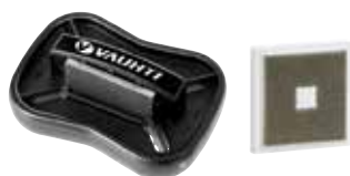
2000-4002N EASY SHARP (BASIC)