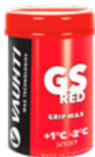
357-GSR GS RED +1/-2°C | 34/28°F