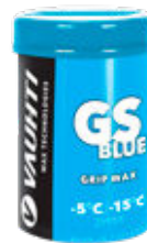
357-GSB GS BLUE -5/-15°C | 23/5°F