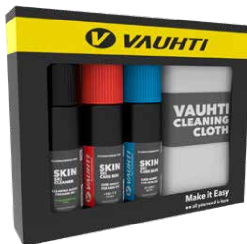
32410-SSKIT SKIN SKI KIT