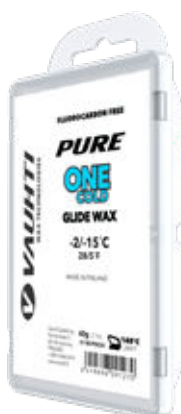
31140-ONEC60 31141-ONEC180 PURE ONE COLD -2/-15°C | 28/5°F