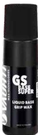
341-LGSBAS GS BASE SUPER - liquid base grip wax

Durable all temp liquid base wax. Use as base for all other grip waxes.