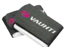
130-01510 SKI STRAPS