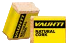
105-00920 NATURAL CORK