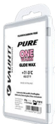
31140-ONEW60 31141-ONEW180 PURE ONE WARM +7/-3°C | 45/27°F