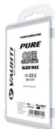
31140-ONEG60 31141-ONEG180 PURE ONE GRAPHITE -1/-25°C | 30/-13°F