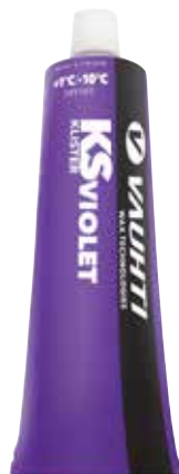
375-KSV KS VIOLET +1/-10°C | 34/14°F