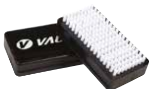
115-01020 NYLON BRUSH LARGE