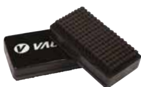
115-01040 HORSE HAIR BRUSH