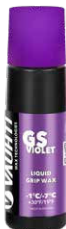
341-LGSV GS VIOLET - liquid grip wax -1/-7°C | 30/19°F

Durable all temp liquid base wax. Use as base for all other grip waxes.