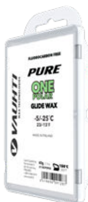
31140-ONEP60 31141-ONEP180 PURE ONE POLAR -5/-25°C | 23/-13°F