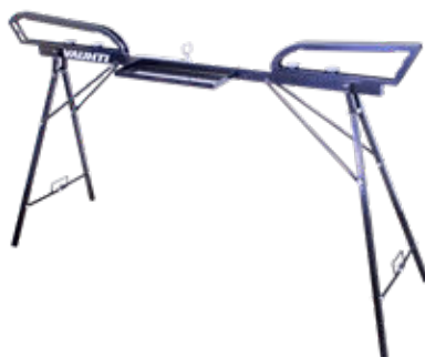
400-RWB WAX BENCH WITH ONE PROFILE PROFESSIONAL