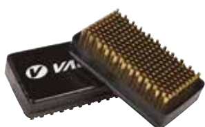
115-01050 BRASS BRUSH