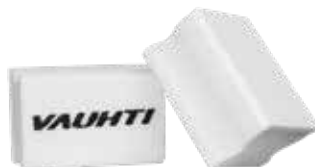
115-00912 SYNTHETIC CORK WITH FELT