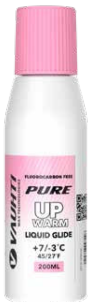
32130-UPW200 PURE UP WARM +7/-3°C | 45/27°F For wet and damp snow down to -3°C degrees.. conditions.