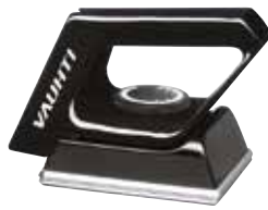
119-V1000 WAX IRON PROF EUROPE 1000W