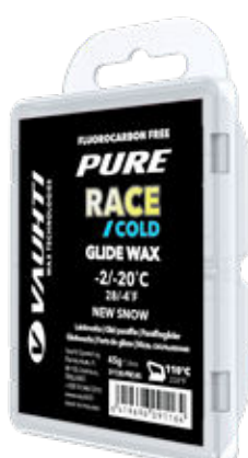
31110-RACENSC45 PURE RACE NEW SNOW COLD -2/-20°C | 28/-4°F