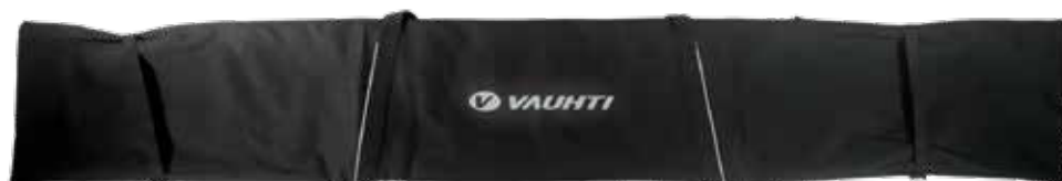
130-01537 VAUHTI CROSS-COUNTRY SKI BAG 3 PAIRS