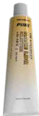
385-KPRLDR RACE LDR +5/-10°C | 41/14°F