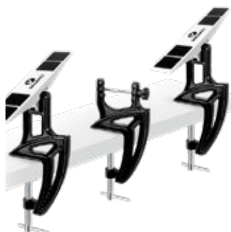
400-670 SKI VISE NORDIC