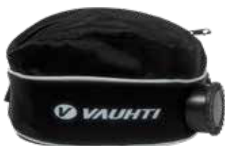
130-01523 VAUHTI THERMO DRINKBELT