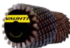
115-01076 ROTO STEEL/ HORSE HAIR BRUSH 140MM