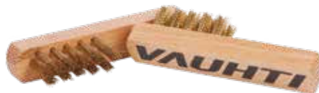
2000-FB910 FILE BRUSH