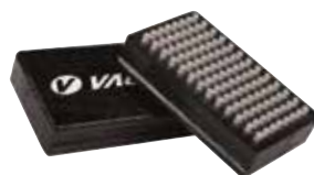
115-01025 NYLON FINISHING BRUSH