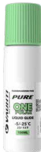
32140-ONEP100 PURE POLAR -5/-25°C | 23/-13°F For cold and dry snow conditions.