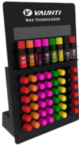
400-1006B SALES DISPLAY BLACK FOR 42 BOTTLES