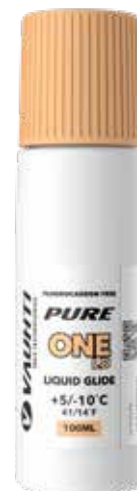
32140-ONELD100 PURE ONE LD +5/-10°C | 41/14°F For wide temperature range and for variable conditions.