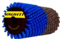
115-01075 ROTO NYLON/ HORSE HAIR BRUSH 140MM