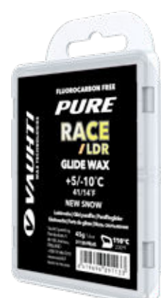
31110-RACENSLDR45 PURE RACE NEW SNOW LDR +5/-10°C | 41/14°F