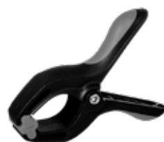
2000-3091 RACING FILE CLAMP