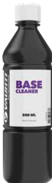
930-BC500 BASE CLEANER 500ml