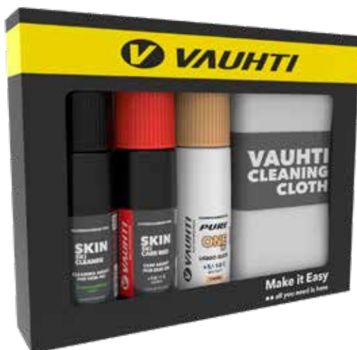
32410-SSPOGKIT SKIN SKI & PURE ONE GLIDE KIT