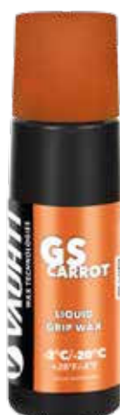
341-LGSC GS CARROT - liquid grip wax -2/-20°C | 28/-4°F

Liquid grip wax for fresh and fine natural snow in mild winter conditions.