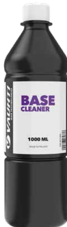
930-BC1000 BASE CLEANER 1000ml