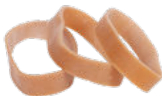
2000-RB RUBBER BANDS