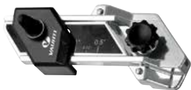
2000-3071 ADJUSTABLE BASE SHARP