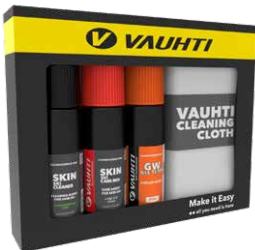
32410-SSGKIT SKIN SKI & GLIDE KIT