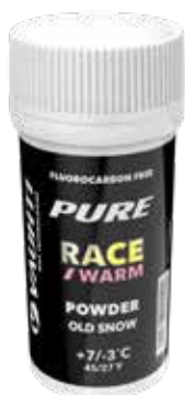
31110-RACEOSW35 PURE RACE OLD SNOW WARM +7/-3°C | 45/27°F