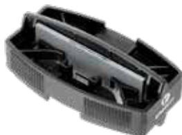
2000-5006 RACING SHARP