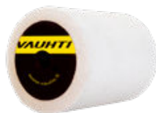
115-01074 ROTO FLEECE BRUSH