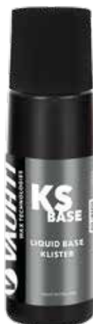
341-LKSBA KS BASE - liquid base klister

Liquid grip wax for cold winter conditions. Especially old and man-made snow.