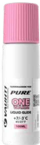
32140-ONEW100 PURE ONE WARM +7/-3°C | 45/27°F For wet and damp snow down to -3°C degrees. conditions.