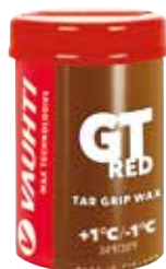
367-GTR GT RED +1/-1°C | 34/30°F

Pit tar, made from Finnish pine, is one of the the raw materials used in the Tar Grip waxes. In addition to the pleasant aroma, tar waxes have a wide operating range and more convenient waxing properties. The waxes are especially suitable for recreational skiers, although their qualities are attractive for even the most demanding racers as well.