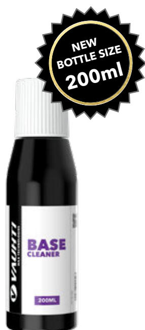
930-BC200 BASE CLEANER 200ml

Base cleaners for cleaning the ski base and surface.