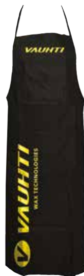
130-01611 WAX APRON