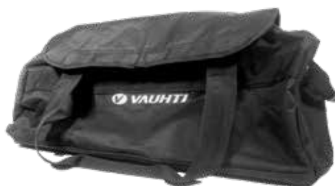
130-01529 VAUHTI BAG