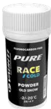
31110-RACEOSC35 PURE RACE OLD SNOW COLD -2/-20°C | 28/-4°F