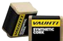
105-00910 SYNTHETIC CORK