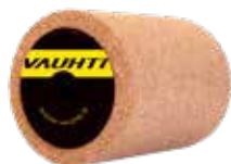
115-01071 ROTO NATURAL CORK BRUSH