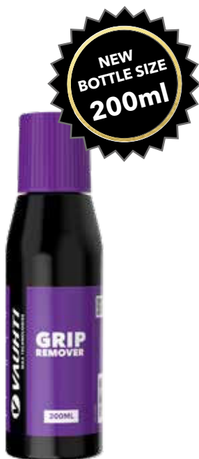
930-GR200 GRIP REMOVER 200ml

Grip removers for removing the grip waxes from grip zones.