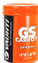
357-GSC GS CARROT -1/-6°C | 30/21°F