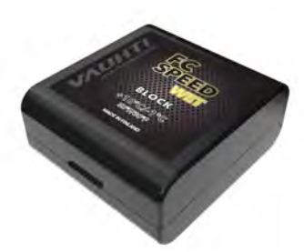
FC SPEED WET +10/-3°C|50/30°F

FC Speed blocks are based on the corresponding fluorocarbon powders. FC blocks can be used on top of the liquid glides, base waxes, fluorinated waxes or fluorocarbon powders. Apply into the base with either an iron, natural cork, fleece or whool.