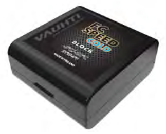
FC SPEED COLD -6/-20°C|21/-4°F

For all snow types, especially on new snow and damp snow.